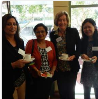
Staff from NCIRS