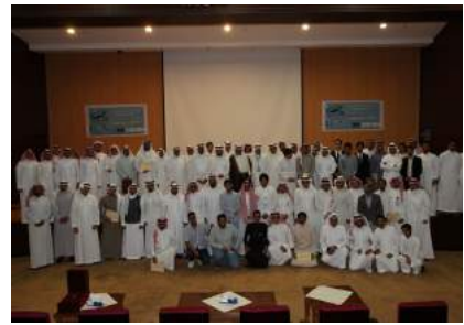
Male volunteers at the Hajj