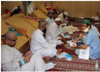
Medical Research Officers with Hajj pilgrims

The team are now continuing their post-Hajj follow-up in the community.