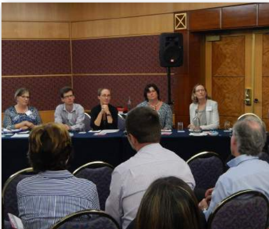
Session 1 panel