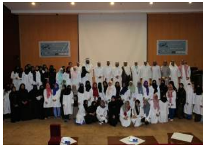
Female volunteers at the Hajj