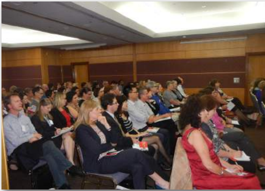
Attendees at the seminar