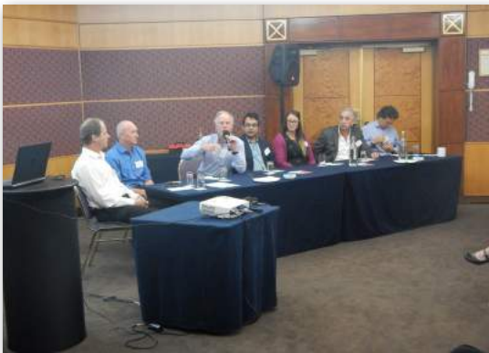
Session 2 panel